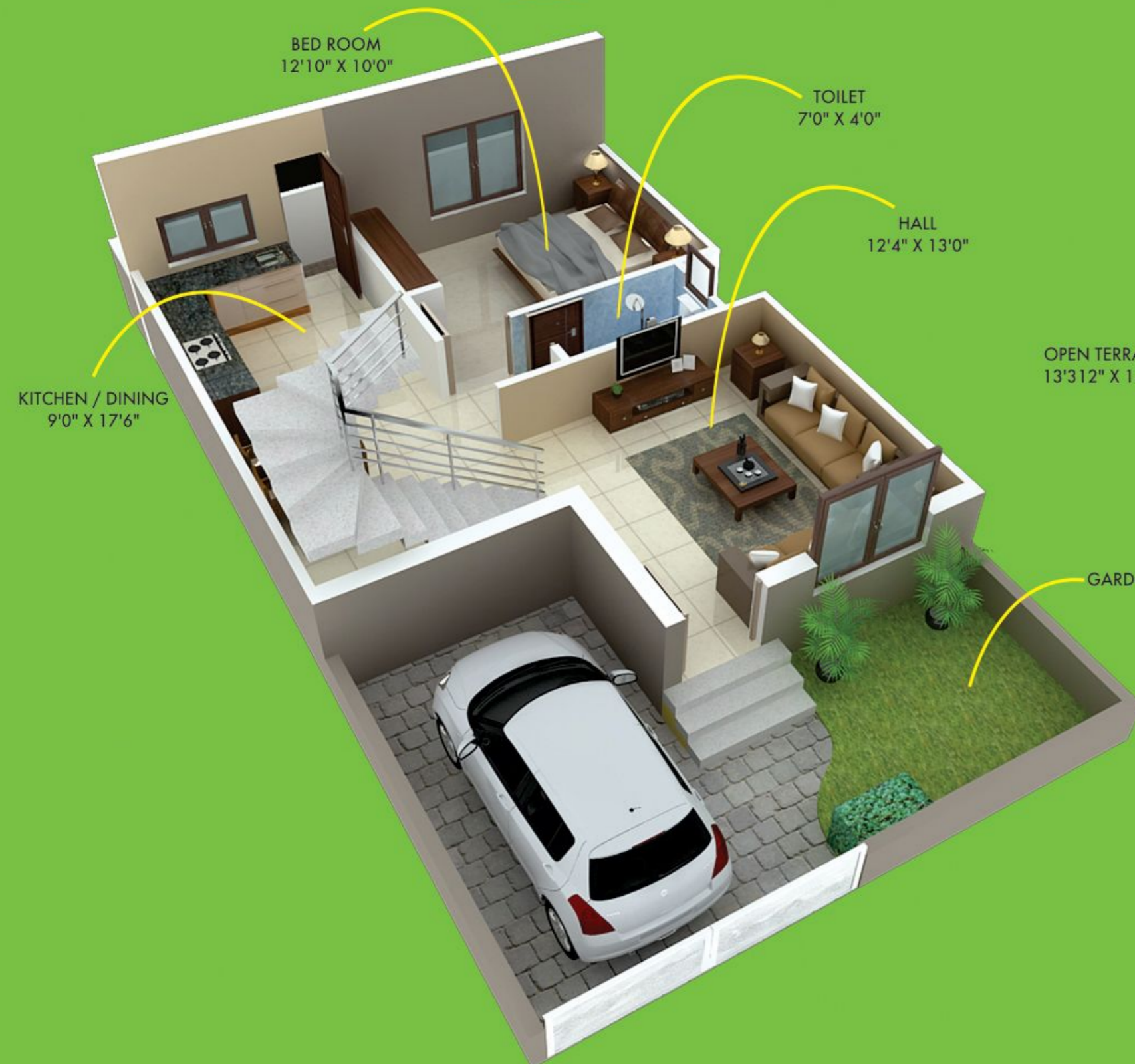
Ground Floor 1 BHK